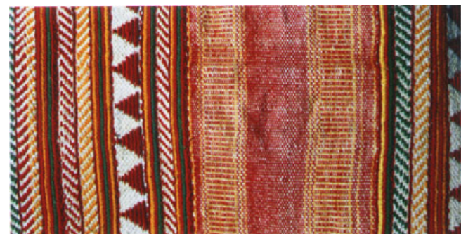
Detail of the embroidery

Women of the Dongaria Kondh tribe embroider a scarf called kapra gonda which they wear over a white sari with a red border. This sari is a single length of fabric that is draped around the lower and upper part of the body and complemented with one scarf worn around the waist and the other draped on the chest. The scarf is given as a token of a proposal by an eligible boy to the girl of his choice. It is embroidered by his sisters or by girls for their lovers. The scarf is woven in basket weave by male weavers of the Dom community and subsequently embroidered by the Dongaria women.